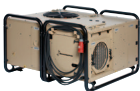
ACM 11 mobile cooling unit