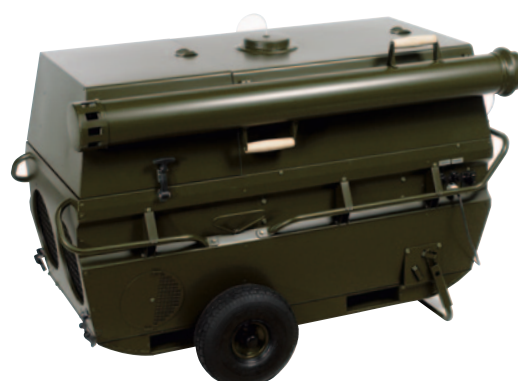
VAM 40 MK II mobile heating unit