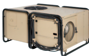
ACM 18 mobile cooling unit