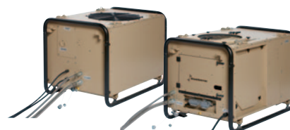
ACM 18 CBRN mobile cooling unit