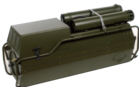
VAM 15 MK II mobile heating unit