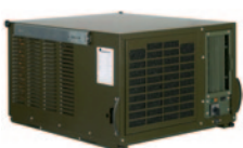
ACM 5 mobile cooling unit