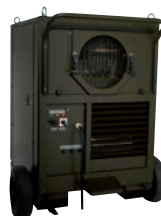
ACM 7 MK II mobile cooling unit